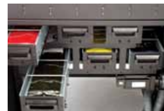
Ink container for 2kg of ink

d.gen's unique textile feeding system from roll to roll fabric allows direct printing on most of woven fabrics like flag, display material and the new d.gen power stretch even without stick belt.