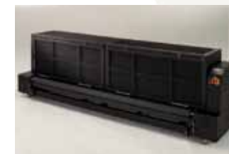
HeatMAN Grande (Option)

Touch panel for easy handling of precise work. The workstation stand for rip s/w enables simple and concentrated operation.