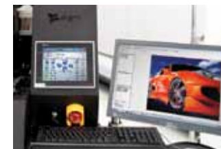
Touch panel and workstation stand

Air wiper can clean dust without any contact or damage to sensitive print heads for high quality production continuously.