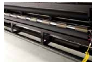
Patented textile feeding system

Latest version of print head with 1,152 nozzles per color and 19.5cm printing band which enables to print as speed up to 190 m 2 /h.