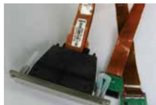
Ricoh's GEN4L print head

Latest Ricoh GEN4L PIEZO print head contains 384 nozzles. The true grey scale allows selectable drop size from 15p, 30pl, 45pl and max 30KHz high speed frequency.